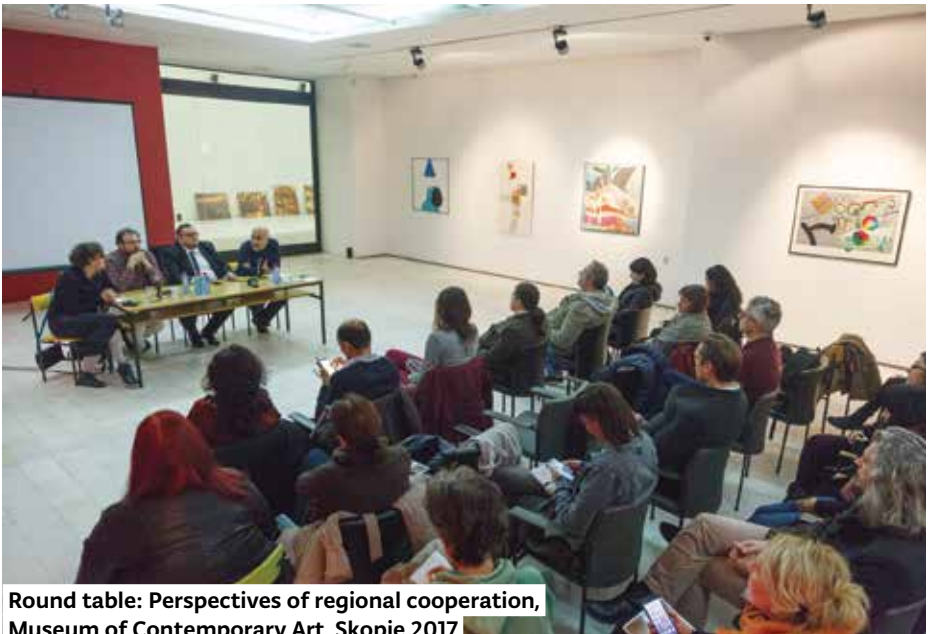
Round table: Perspectives of regional cooperation, Museum of Contemporary Art, Skopje 2017