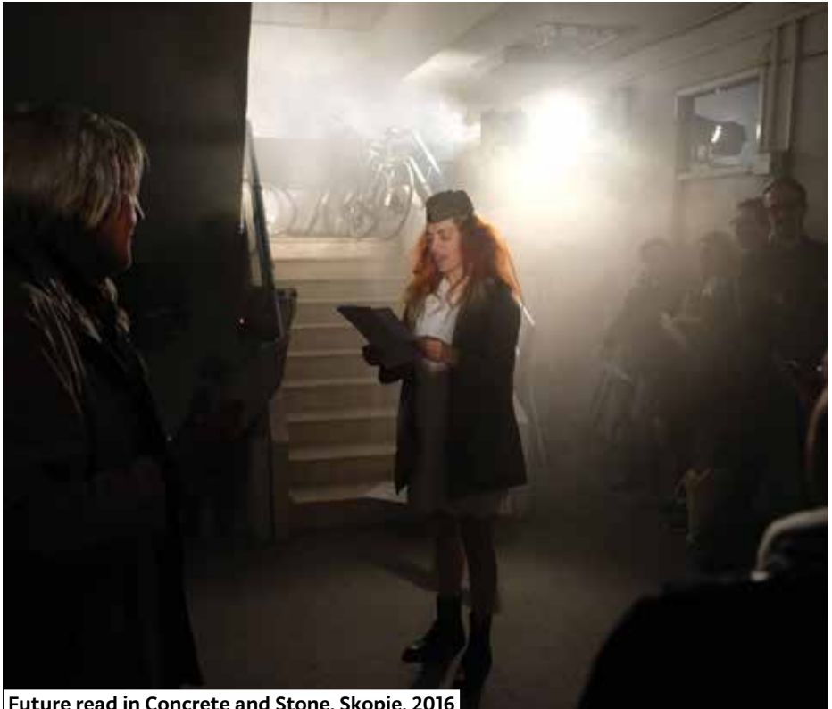
16 Future read in Concrete and Stone, Skopje, 2016