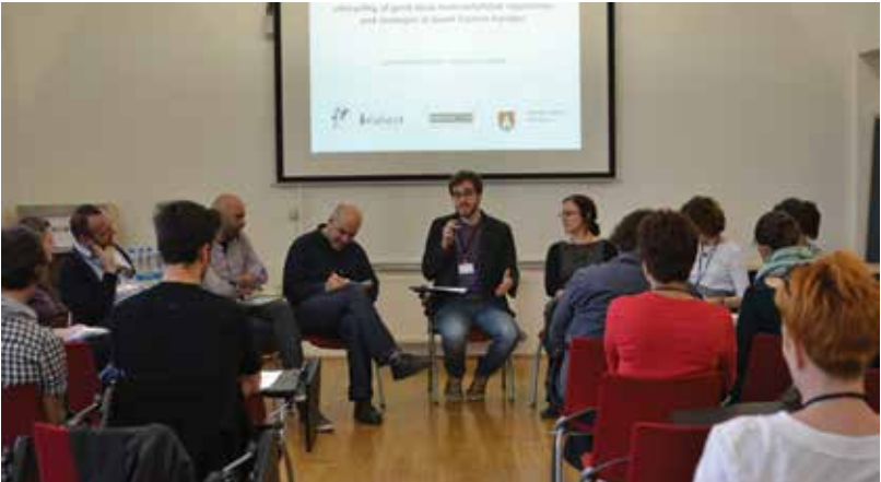
Regional Workshop Recycling of good ideas from unfulfilled regulations and strategies in South Eastern Europe, Ljubljana, 2014