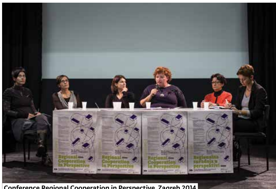
Conference Regional Cooperation in Perspective, Zagreb 2014