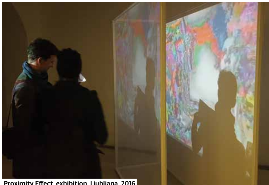
Proximity Effect, exhibition, Ljubljana, 2016