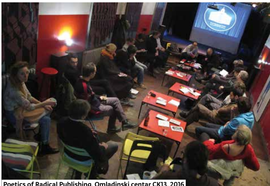
Poetics of Radical Publishing, Omladinski centar CK13, 2016